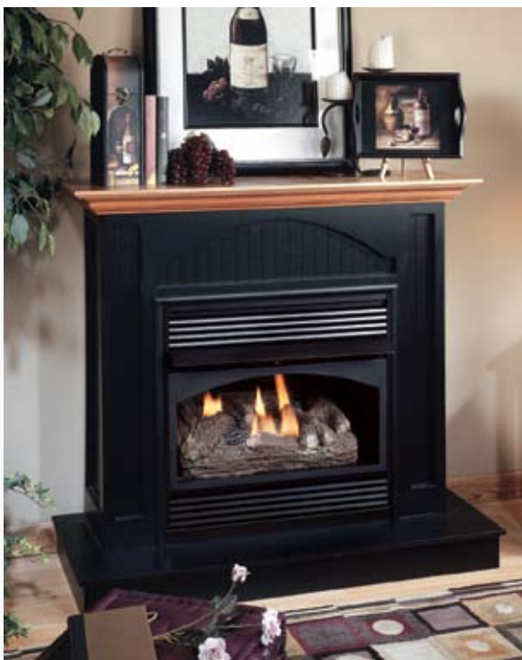
(Top) The new Mini Classic is a small, bedroom-approved fireplace. Cabinet mantels are available in wall or corner mantels. (Right) The Single Burner Compact Classic will fit almost anywhere.

Compact Classic Hearth – Single Burner 26" (VMH26): When space is at a premium, a Vanguard Single Burner Compact Gas Classic Hearth System is the perfect choice. Enjoy all of the same features and benefits of a full-size Classic Hearth. These complete systems include a zero-clearance compact firebox, vent-free split oak gas logs, black louvers and concealed controls.