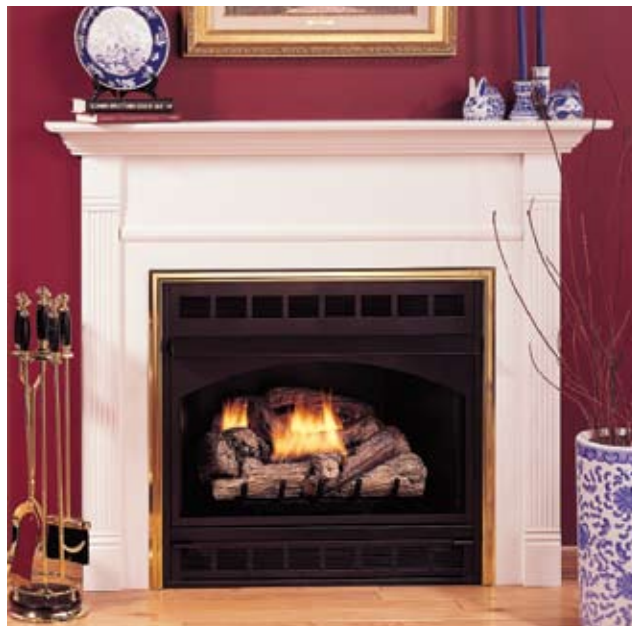
The Flame-Max Classic Hearth features 24" Golden Oak Logs and brilliant yellow flames. Shown recessed with a custom mantel and the optional firebox perimeter brass trim. (VYGF33R, PT32PB)

The thermostatically controlled model is equipped with an automatic variable speed blower, while the remote control ready models accept a blower accessory. Thermostatically controlled models offer 28,000 Btu, the remote control ready models offer 33,000...enough to heat up to 1,100 square feet.