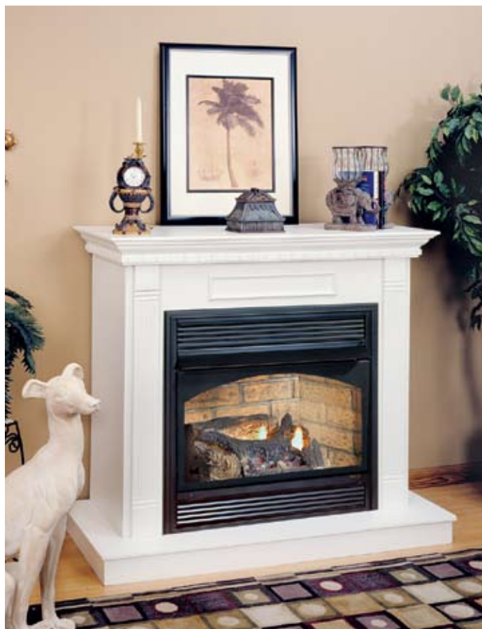
The Total Control System offers the ultimate in convenience, with a standard remote control, which can light the pilot.

Total Control System (VTGF33): Gone are the days when you had to stoop down or lie flat on the ground to light your pilot light or control your heat output. With Vanguard's new Total Control System (TCS) Classic Hearth, it's as easy as the push of a button on the hand-held remote or wall switch.