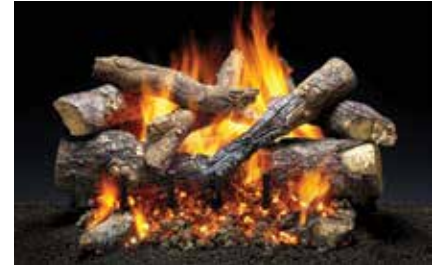
Fireside Gas Logs