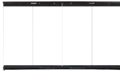
Bi-fold Glass Doors