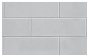
Traditional Natural Gray