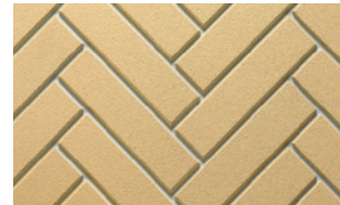
Herringbone Firebrick Yellow